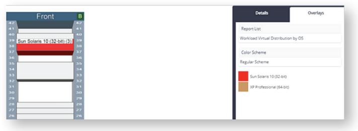
Nlyte Asset Optimizer Cabinet Planner – Row View for Nutanix